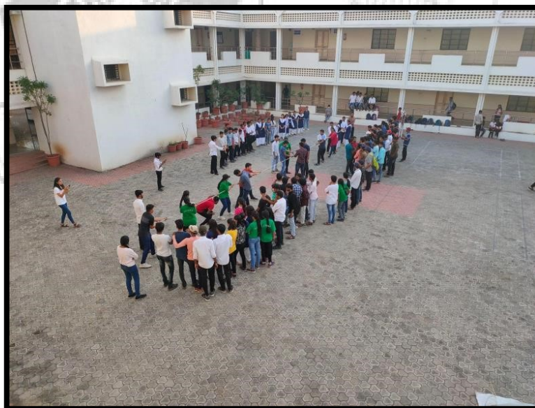
Some moments before the Tug of War match.