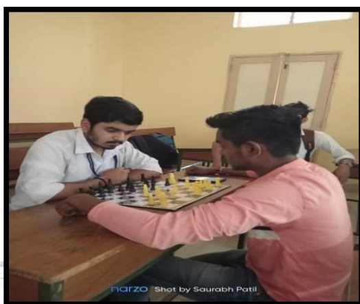
And it's a Checkmate.