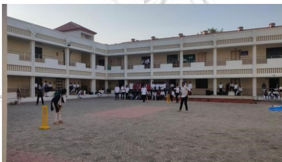
The Finals of Box Cricket.